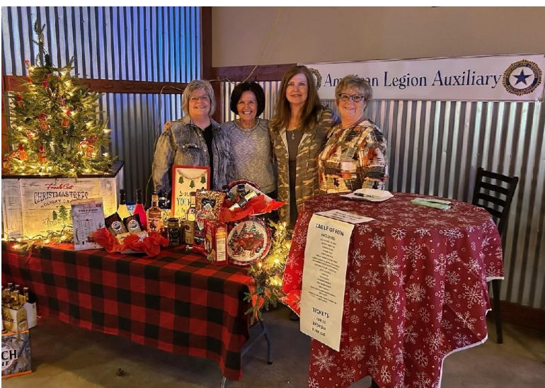
Table of Fun

****In place of a Silent Auction there will be a 50/50 Raffle. Tickets available at the Registration desk. Proceeds go to the President's Project-DTOM