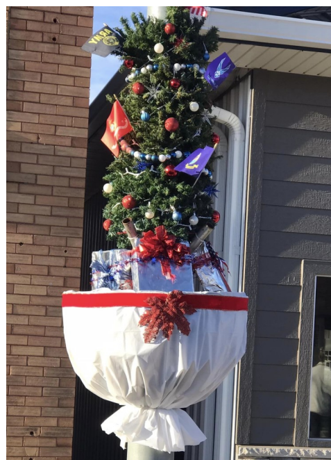
Britton Unit #80 decorated a patriotic Christmas tree for the Britton event Center.