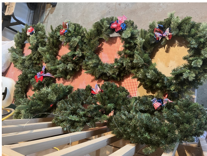
Irene ALA purchased wreaths and placed them on flag pallets. The pallets were painted by the Auxilia and placed at the homes of families of active duty service members.