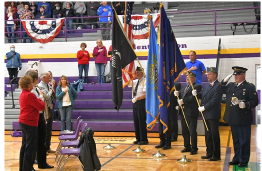
Veterans' Day program at the Stanley County School District.

They had the 2021 Girls and Boys State delegates share their experience. "It was a wonderful community gathering."