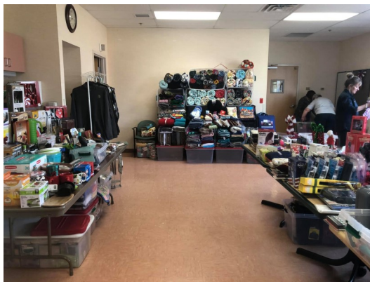
Hot Springs VA Medical Center