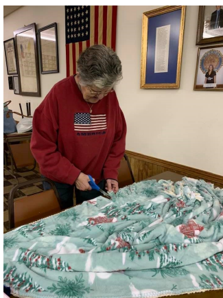
Post 140 Auxiliary worked on pillowcases and made 10 lap robes for the VA.