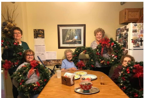
The Cresbard American Legion Auxiliary made poppy Christmas wreaths. They presented a wreath to local veterans and one to their 102-year-old Auxiliary member.