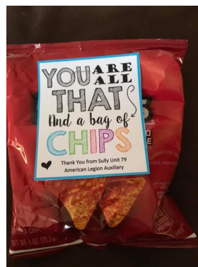
Sully Unit 79 of Onida gave treats to our teachers and staff for American Education Week. Unit 22 stole your idea for Pinedale and Robbins Dale elementary school teachers in Rapid City.