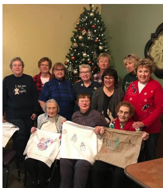
Cresbard, Faulkton and Orient American Legion Auxiliaries had a fun day decorating 22 pillowcases for their local veterans. They had a wonderful lunch and shared wonderful friendships.