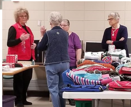
Sioux Falls VA Medical Center