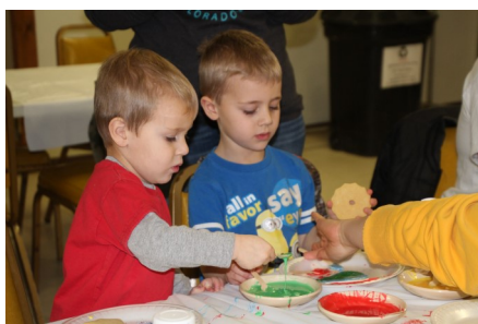
Stratford Auxiliary held their annual cookie decorating day. Lots of sticky, sweet fun.