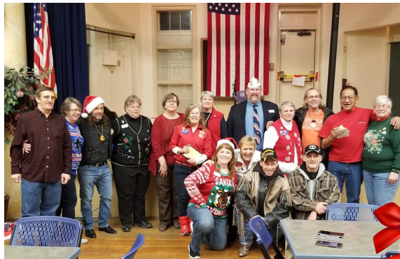
Hot Springs VA Medical Center