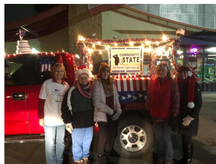
Spearfish Unit 164 celebrated the ALA 100 th Birthday at the Parade of Lights