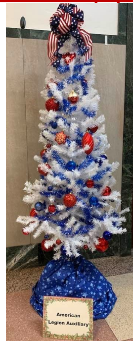
Officers were busy with their Post 140 Auxiliary Tree at the McCook County Courthouse.