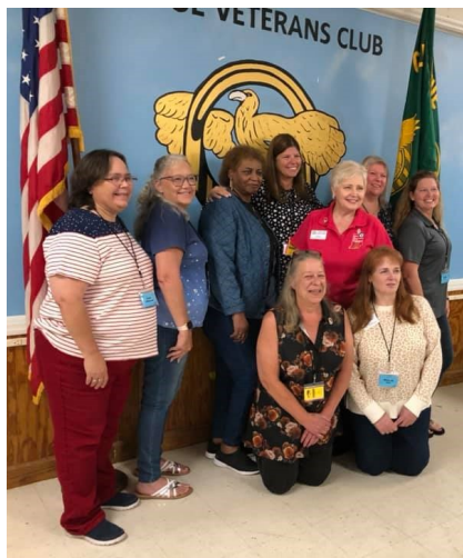
Some of the Department Presidents attending the homecoming, in Kentucky.