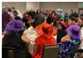
The banquet's theme was Derby Time!