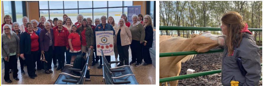
At the airport and at the DTOM Veterans Ranch. More in December.