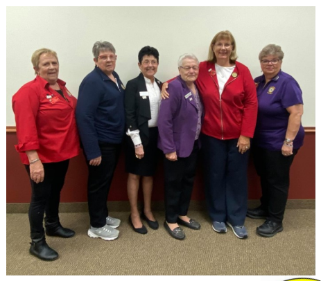
District 4 - Host: Redfield Unit 92