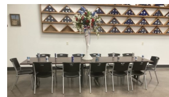
District One in Isabel Unit #120

On behalf of the American Legion Auxiliary Unit 42, thank you to the American Legion and the SAL 42 for setting up a table for the 13 fallen soldiers.