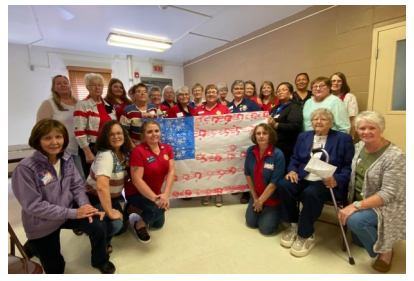
District 2 - Host: Rapid City Unit 22