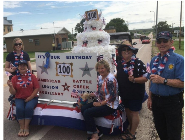
Hermosa Unit 303 took first place with their 100th Birthday float at the Custer Co. Fair

Herrick American Legion Allen Loudon Post 220 and Auxiliary held their membership supper October 14, 2019 and celebrated the 100 th birthday for both organizations. The Legion was founded in March 1919 after the end of World War I. The American Legion Auxiliary began on November 10, 1919 to support the Legion and honor the sacrifices of those who serve by enhancing the lives of our veterans, military, and their families, both at home and abroad. A decorated cake and ice cream were served to those in attendance.