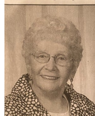
Celebrating 98 years