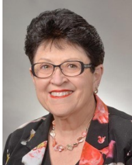
"Saddle Up for Veterans"