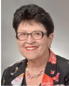
"Saddle Up for Veterans"