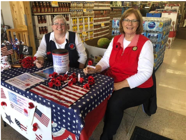
Many other Units had Poppy Days! These were the Units who had pictures available for publication.