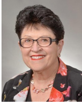
"Saddle Up for Veterans"