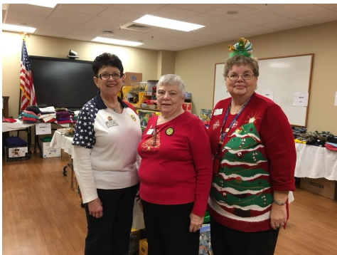
Left: Sioux Falls VA