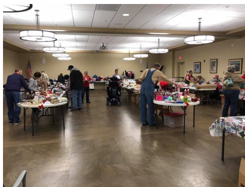
Below: Hot Springs State Veterans Home