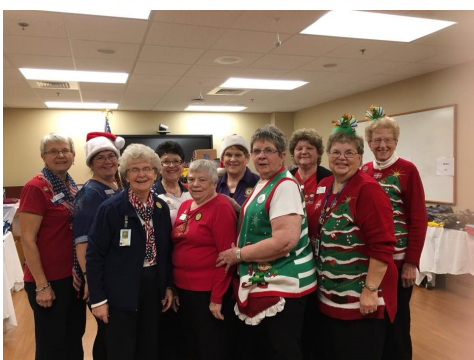
Below: Hot Springs VA