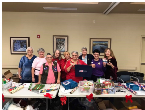
Below: Ft Meade VA