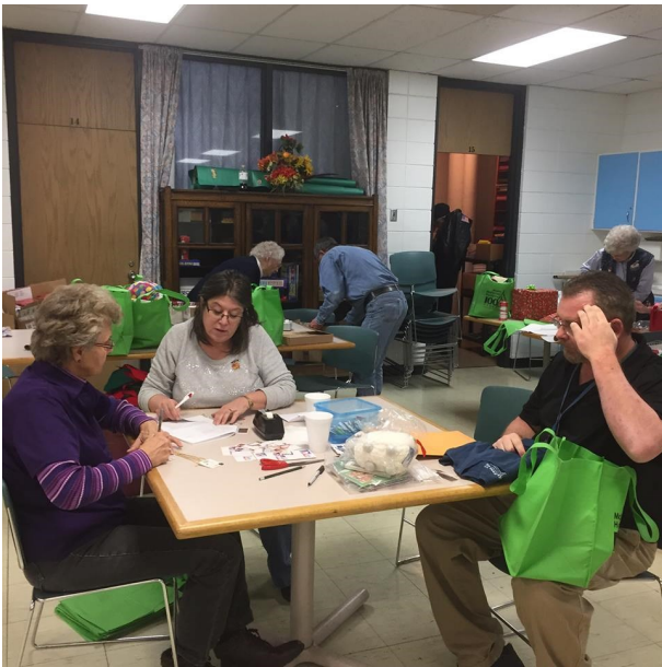
Below: Our helping hands at the Human Service Center in Yankton