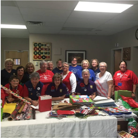
Left: Getting ready to wrap the presents at the gift shop at the Ft. Meade VA.