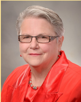
"Joining Together for Our Veterans"

I hope you had a blessed Christmas season and I wish you an awesome new year. We had great Gifts Shops and Christmas Parties. The chairmen did a wonderful job. It is so rewarding. It is also fun to see how each facility does things—how they are the same, but very different in many ways.