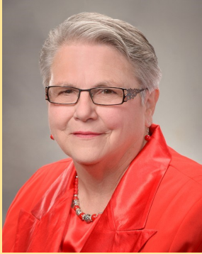
"Joining Together for Our Veterans"

It is a busy time for the Auxiliary. We had a pre-Centennial Strategic meeting, a Constitution & By-Laws meeting, and a Girls State Corporation Board meeting; my weekends have been full. I was honored to attend the dedication of the Veterans Memorial in Springfield. I also attended the Memorial Program at the Hot Springs VA where they honored all their deceased veterans for this year. There were 217 names read. Just think, this is just one VA, we have three. I want to thank everyone that attended the Centennial Strategic meeting in Mitchell.