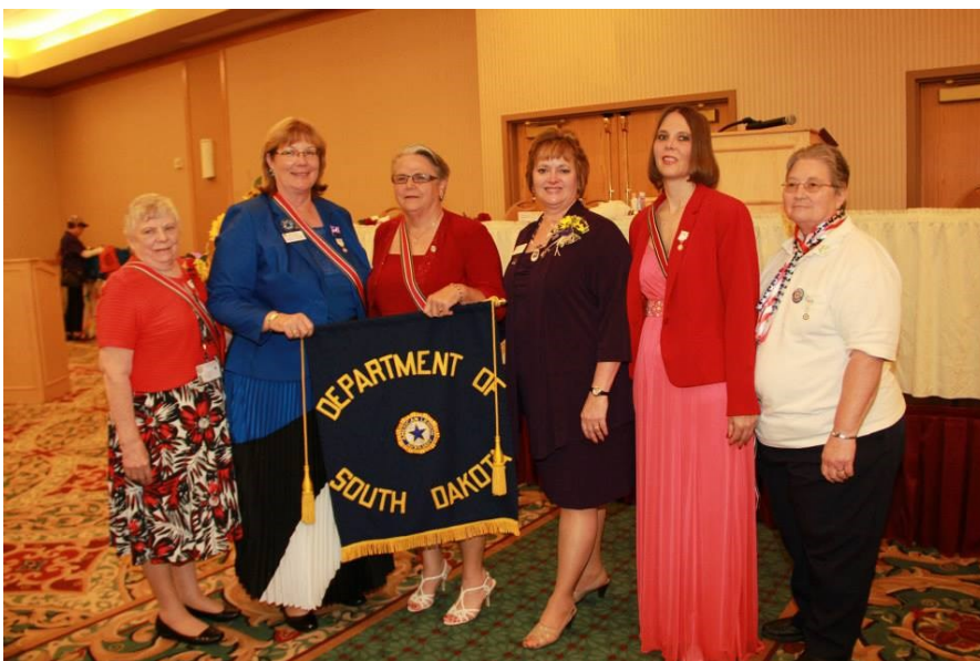
The 2015-2016 South Dakota newly elected and installed Department Officers: