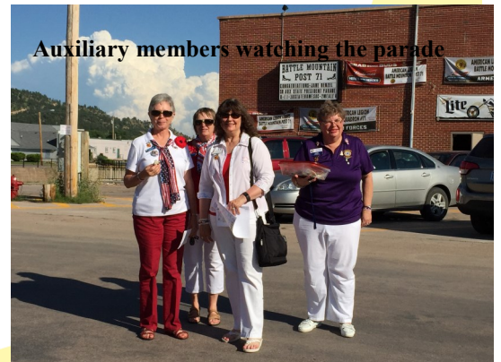
Auxiliary members watching the parade