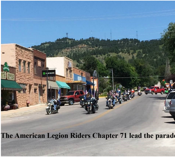
The American Legion Riders Chapter 71 lead the parade