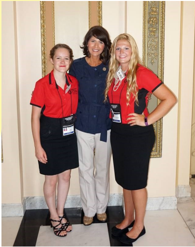
SD Girls Nation

Service, Not Self – Districts and Units at Work