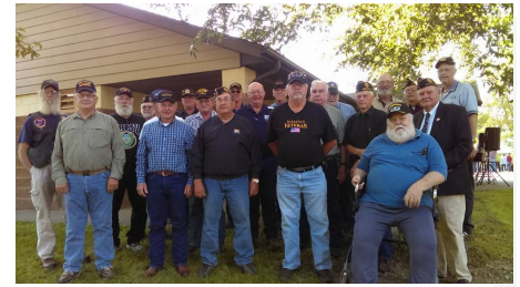
Patriot Day - Welcome Home