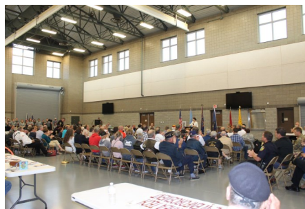
Watertown Unit 17—HUG a HERO