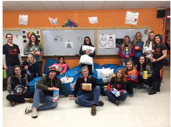
Top L-R Memno High School Student Council; Howard High School District. Left: The Auxiliary members of Rapid City Unit 22 delivered baskets to the Mission Cornerstone in Rapid City. The Mitchell High School collected supplies for the Buddy baskets and delivered them to the American Legion Post. Bottom: Iroquois Elementary Student Council