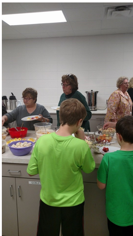
Annual Mitchell Unit#18 American Legion Auxiliary St. Patrick's Day Luncheon What Fun Event May God bless all attending members Veterans families for helping out to make it huge success.