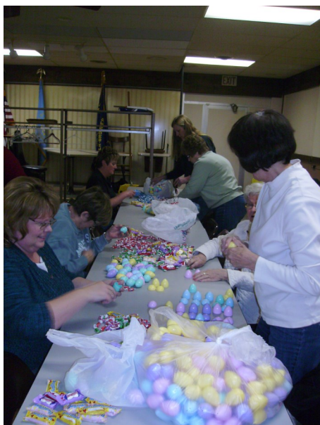
March Community Service project. Several of Mobridge Unit 4 members filled 4000 plastic Easter Eggs w/ candy for the annual Easter Egg Hunt on Sat March 26th in Mobridge City Park.