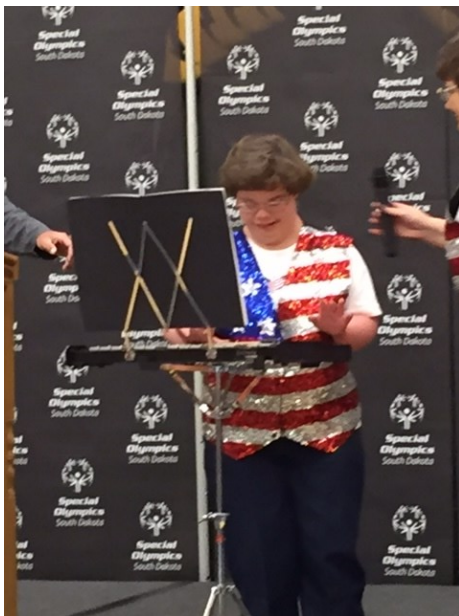
Opening ceremony of the Special Olympics Summer Games in Spearfish