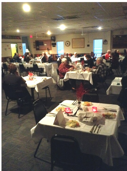
Sioux Falls Unit 15 made Valentine cards and held a dinner for veterans and their families.