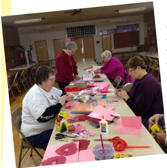
Dell Rapids Unit members were busy making cards for veterans and had a Valentine spaghetti dinner for local veterans.