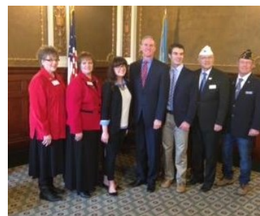
2014 Girls and Boys State Governors 2014 at the Legislature session 2015 with Governor Dugaard.