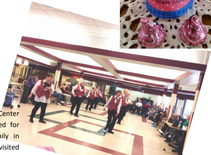
The Spearfish Senior Center Line Dancers performed for 57 residents and family in attendance. Unit 164 visited 19 rooms of veterans to give them a Valentine gift bag.