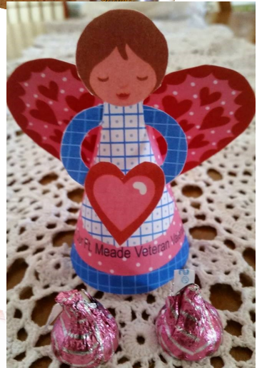
Homestake Unit 31 of Lead made these crafty angels for the veterans at Ft. Meade VA.