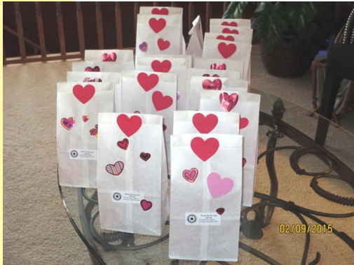
Spearfish Unit 164 made 80 gift bags to distribute at Ft. Meade VA and the Dorsett Healthcare.