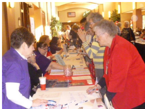
The Program Fair - Department Chairmen were able to showcase, share, inform, and give information, flyers, and sometimes gifts to participating members. The Legion enjoyed browsing the fair too!