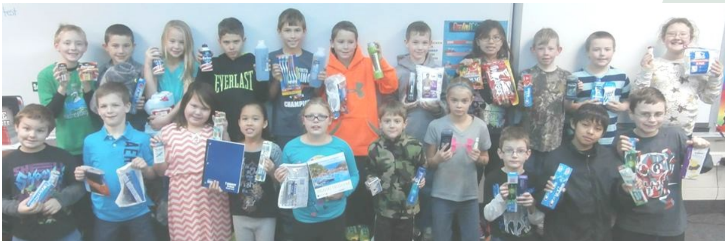
Below: Twenty-three Jefferson Elementary 3rd graders from Pierre, proudly displaying some of the items they collected. Their hard work will benefit the veterans who gave all and lost their belonging in the Pierre Capital Inn fire.