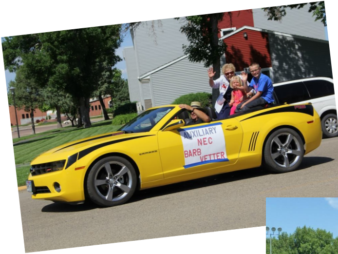
Photo Gallery SD Department Convention - Pierre