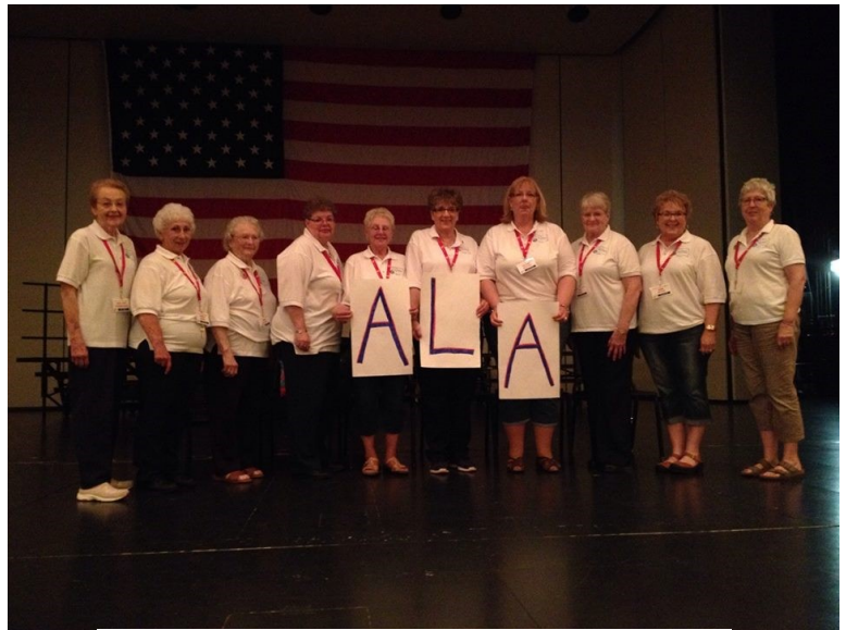
A skid to teach the Girls State delegates the meaning of the organization who made their week possible.