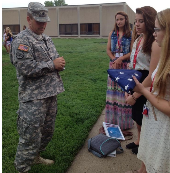
Getting ready for the early morning flag raising ceremony.

The “Thank You “notes will be available in the e-newsletter.